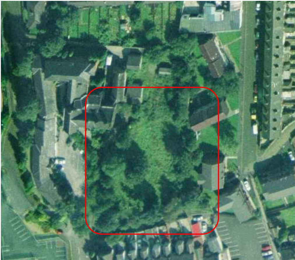
Figure 3: aerial view showing trees on the site of Chesham Old Hall (not to scale)